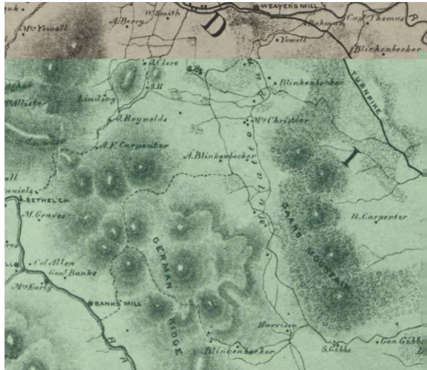
Map of Culpeper, Madison and Rappahannock; Virginia Chief Engineer's Office, 1864 47