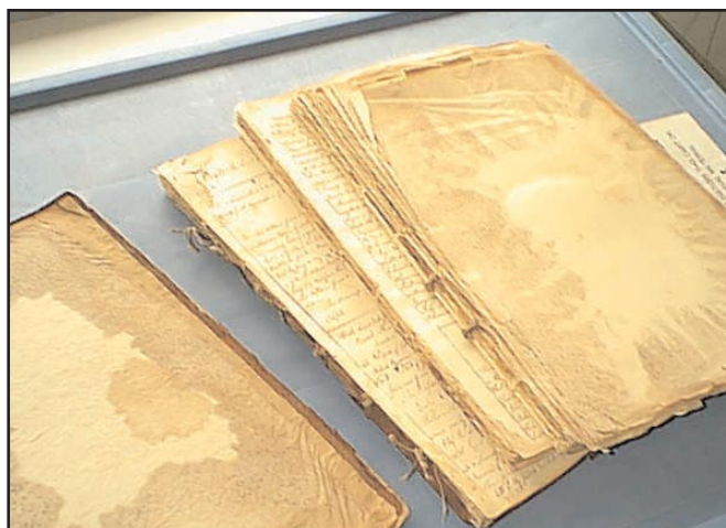
Prince William Order Book before conservation

A: Many clerks have inquired whether they can apply for a grant to back scan their deeds. If there are deeds that have no security microfilm, grant funds are available to scan those records. The scanned images would then be converted to microfilm for security and the clerk's office may use the digitized images in his or her office. For those who wish to back scan strictly for access purposes, grant funds can not be used as the funds are marked for preservation.