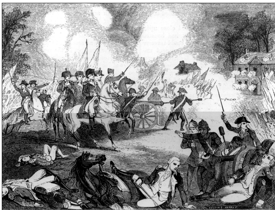
Battle of Germantown, October 2, 1777